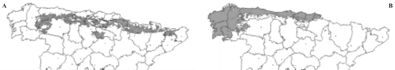
Figure 5. A: Potential high-viability factorial phytoclimatic area of sessile oak in Spain (1,990,400 ha) calculated using the fourth approximation (minimum scalars). B: Potential high-viability factorial phytoclimatic area of pedunculate oak in Spain (3,941,400 ha) calculated using the fourth approximation (minimum scalars).

lity were selected; the corresponding territorial area (approximately 3,941,400 ha) is shown in Figure 5b and the factorial ambits of existence are shown in Table 7.