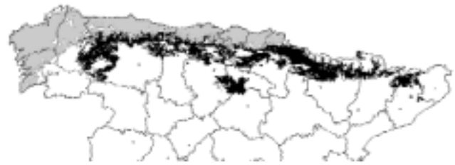
Figure 6. Potential factorial phytoclimatic area of sessile oak in Spain (1,969,00 ha, in black) and pedunculate oak (2,989,000 ha, in grey), calculated using the sixth approximation.

As Table 9 shows, in almost every case (19,690 stations out of 19,904 analysed) Quercus petraea presents a larger phytoclimatic adjustment scalar than any other species occurring in the spectrum and hence comes before all the rest in the hierarchy of that spectrum. In the case of Quercus robur , in 76% of cases (29,890 stations out of 39,166 analysed), this species presents a larger phytoclimatic adjustment scalar than