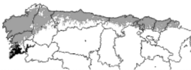
Figure 8. Situation of formations of pedunculate oak withstanding more than one month of aridity in conditions of high phytoclimatic viability (phase 6).

Despite the capacity of pedunculate oak formations in south-western Galicia to maintain positions of high viability even in arid conditions lasting more than 1.5 months, the mean scalar of adjustment, which is used as an index of suitability, is a median of scalars calculated by factorial planes which can mask the isolated occurrence of very low minimum partial scalars, despite the fact that minimum scalars of value 0 were eliminated in the phase 4 filter. For that reason, mean values of minimum partial scalars were calculated as functions of the aridity values for pedunculate oak points in the phase 6 filter, producing the graph in Figure 9. Here we can see that the mean values of the minimum scalars decrease as aridity increases, so that there is a greater risk of limiting situations arising. In fact at aridity values of 1.4 months and upwards, the