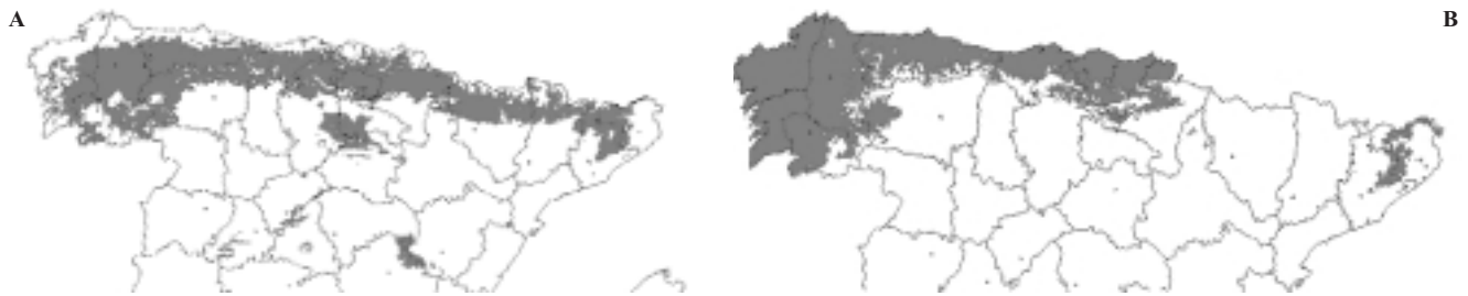
Figure 2. A: Potential factorial climatic area of sessile oak in Spain (approximately 5,663,700 ha) calculated using the first approximation (factorial box method). B: Potential factorial climatic area of pedunculate oak in Spain (approximately 5,082,800 ha) calculated using the first approximation (factorial box method).