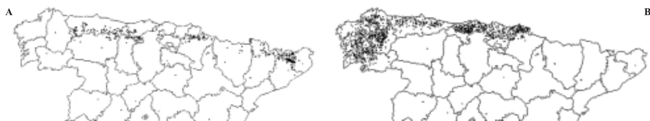
Figure 1. A: Situation of the 577 points from the 2 nd NFI where Quercus petraea occurs as the principal plant formation. B: Situation of the 1,780 points from the 2 nd NFI where Quercus robur occurs as the principal plant formation.

Quercus petraea in the Central System were ignored in view of the small area covered and their currently subordinate status in the hierarchies of their formations, which means that it would be hazardous to consider them in a macroclimatic study. Figure 1 shows the distribution of the sampling points used in this study.