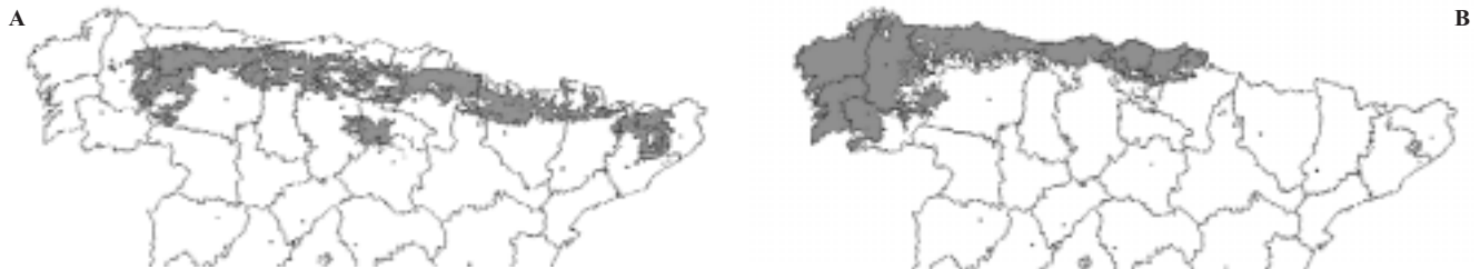
Figure 4. A: Potential factorial phytoclimatic area of sessile oak in Spain (2,740,700 ha) calculated using the third approximation (identity of phytoclimatic terns). B: Potential factorial phytoclimatic area of pedunculate oak in Spain (4,322,300 ha) calculated using the third approximation (identity of phytoclimatic terns).