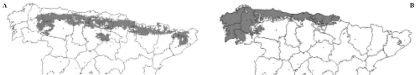
Figure 3. A: Potential factorial phytoclimatic area of sessile oak in Spain (approximately 3,020,500 ha) calculated using the second approximation (convex factorial hull). B: Potential factorial phytoclimatic area of pedunculate oak in Spain (approximately 4,361,500 ha) calculated using the second approximation (convex factorial hull).

selected exclusively for Quercus robur and 2,626,900 ha exclusively for Quercus petraea .